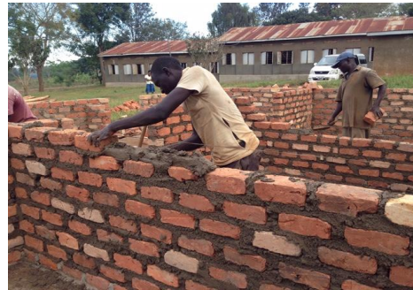
Growth and hope continues today!