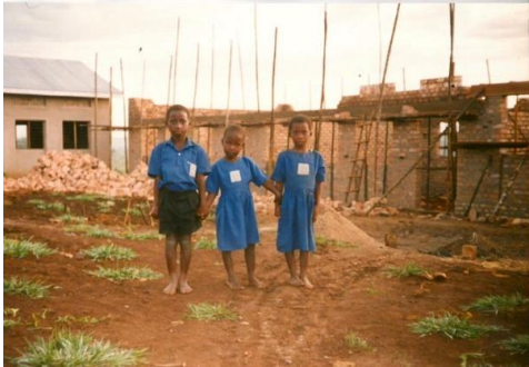
Construction of St. Gertrude School -30 yrs. ago